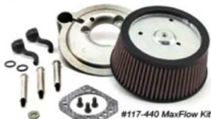
#117-440 MaxFlow Kit