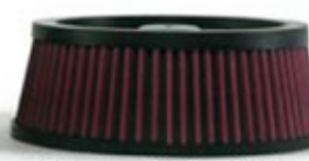
HighFlow Air Filter 2 1/4"