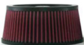
MaxFlow Air Filter 2 3/4"

Zipper's MaxFlow Stage 1 Upgrade for '08up TBW Touring Bikes